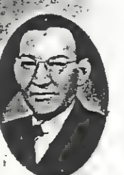
R. L. Hobson Tires Retail